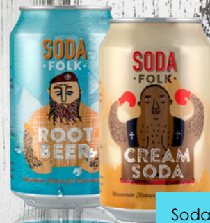
Soda Folk, UK