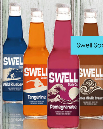
Swell Soda, U.S.