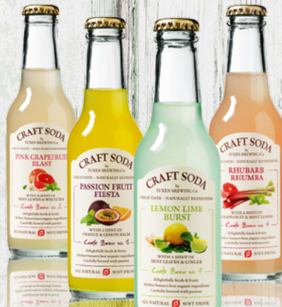
Craft Soda By Tuxen Brewing, Denmark