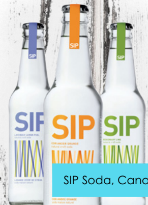
SIP Soda, Canada