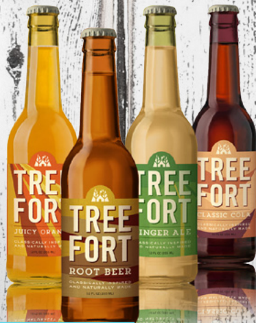
Tree Fort Soda, U.S.