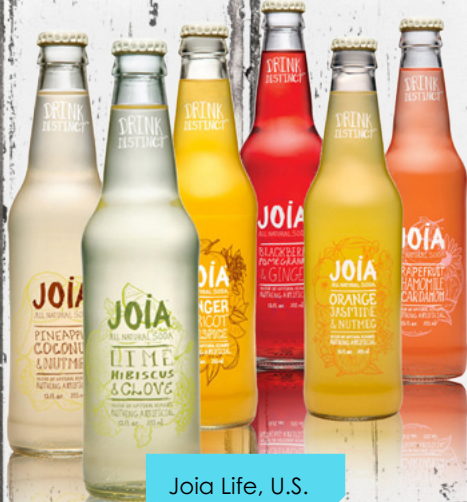
Joia Life, U.S.